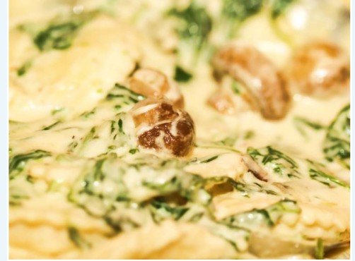
Ravioli, Spinach, Asiago, Wild Mushroom Cream